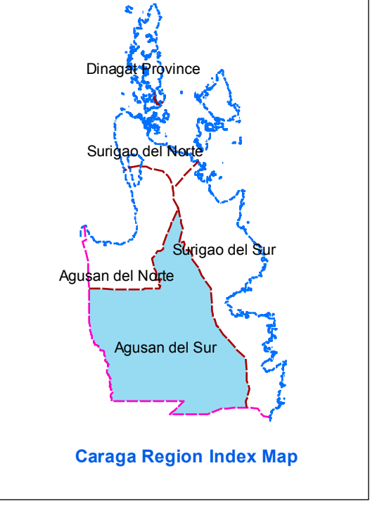
Province of Agusan del Sur Inde